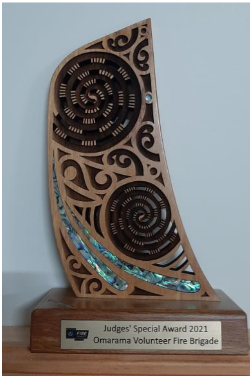
Photos: The trophy and certificate which were awarded to the Ōmārama Volunteer Fire Brigade. (Supplied)

Also thankyou to all the brigades from all over for their efforts in the days that followed which allowed us to recover and get back to our daily life and looking after our patch