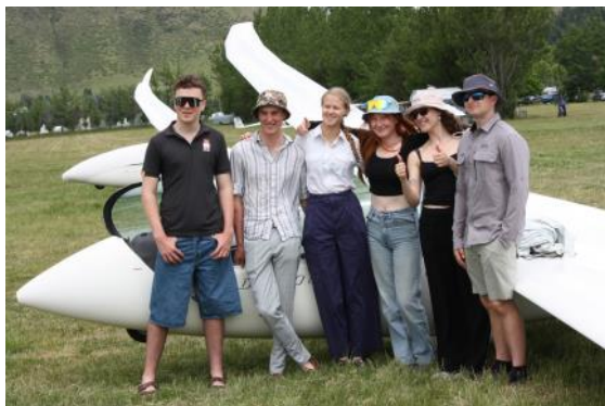
Omarama Gliding Club

At the South Island Regional Gliding Championships - fun was had!