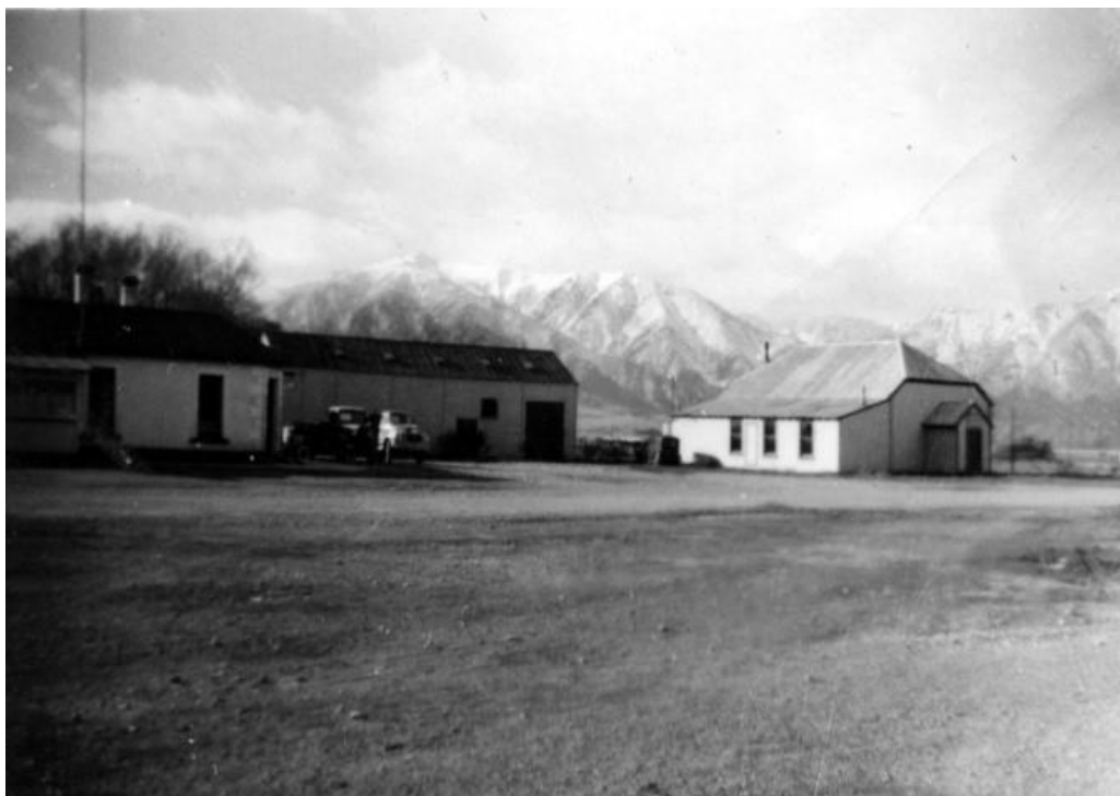
Photo: The original Omarama Hall (right) beside the Omarama Hotel prior to it being destroyed by fire. From It's Our Valley, the second collection, by Lynley Eade.

The 1950s were the time of the Polio Epidemic, 1955/56, and the arrival of electricity to the district.