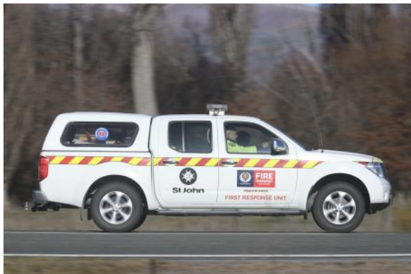
The Omarama Volunteer Fire Brigade's First Response heads to the Lindis Pass to attend a motor vehicle accident on Monday.