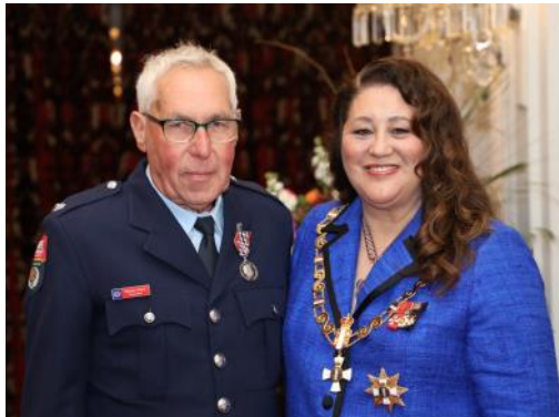
Maurice and Governor General Dame Cindy Kiro stand for the official photo.