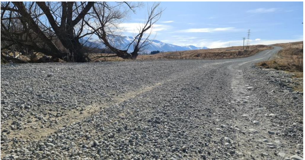
An uphill view of the troublesome corner on Quailburn Rd